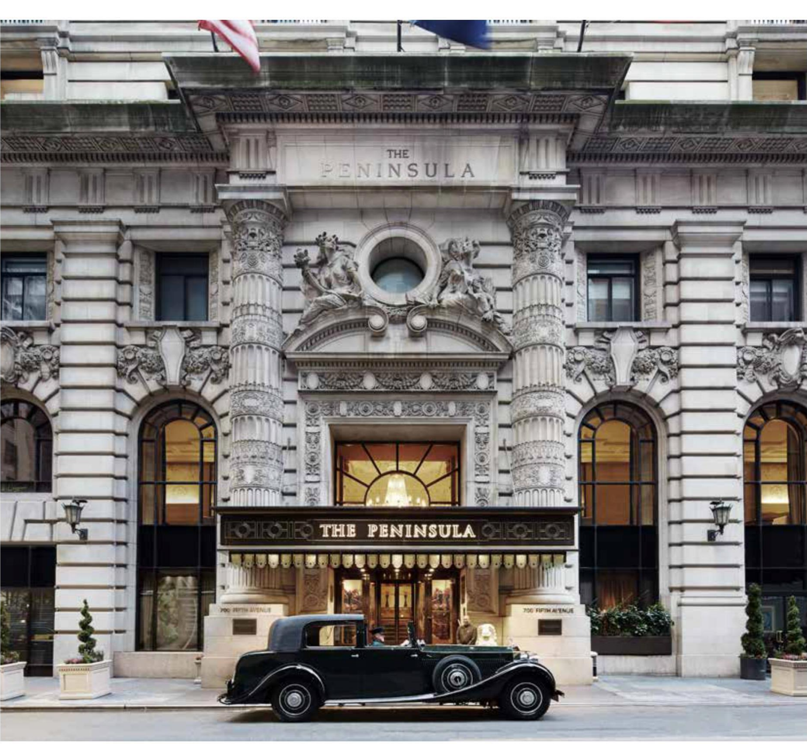
Exterior of The Peninsula New York